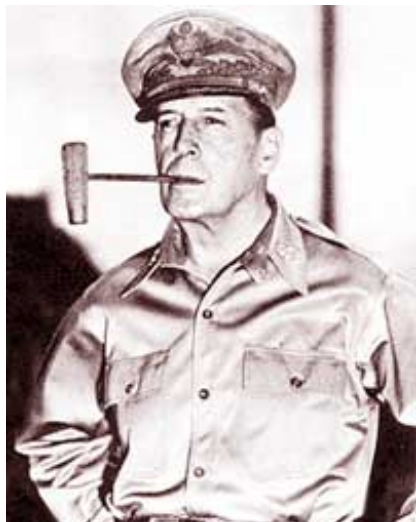
Gen. Douglas MacArthur

There was yet another reason. Weller had been MacArthur's nemesis ever since the correspondent escaped from Singapore and Java to Australia in early 1942, and came under the iron hand of censorship while reporting the struggle up the Pacific islands. The general would have taken Weller's entry into Nagasaki as a personal affront as much as a defiance of his authority.