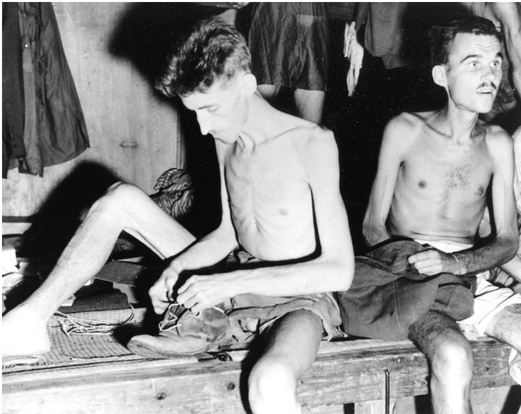
Photo # 80-G-490446 Released POWs at Aomori, Japan, 29-30 Aug. '45