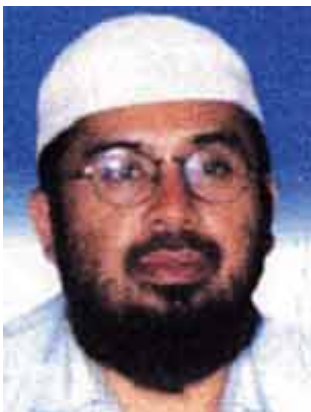
Head of Jamaah Islamiyah

Various incarnations of the group have been involved in rebellions since the mid-20th century. Sekarmadji Maridjan Kartosuwirjo started an indigenous Islamic rebellion on 7 August 1949 – just when Indonesia was gaining independence from Dutch colonial rule. Disappointed with the newly formed Indonesian Republic headed by Soekarno, Kartosuwirjo proclaimed his own Indonesian Islamic State (NII) [3] in opposition to Jakarta's central government. Areas of West Java under NII control were called 'Darul Islam.' An estimated 15,000 to 20,000 people died during the ensuing thirteen-year rebellion, which was finally crushed in 1962. Kartosuwirjo was captured and executed by firing squad. But that was far from the end of DI.