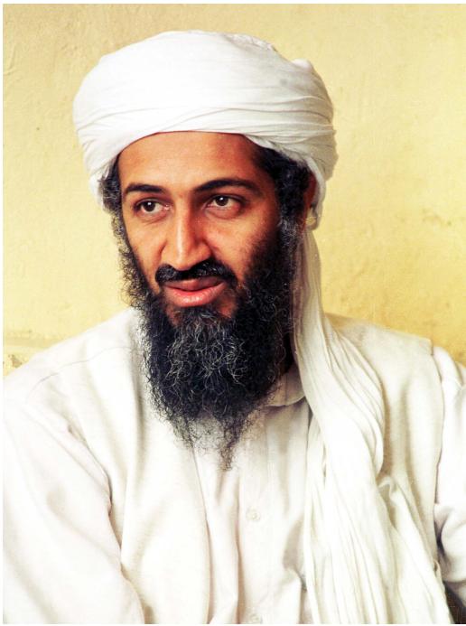
Osama bin Laden

Jl as a case study offers several examples that highlight the complexity of kinship links in terrorism, such as relationships between two or more male siblings, between in-laws, between fathers and sons, as well as more distant kinship relations.