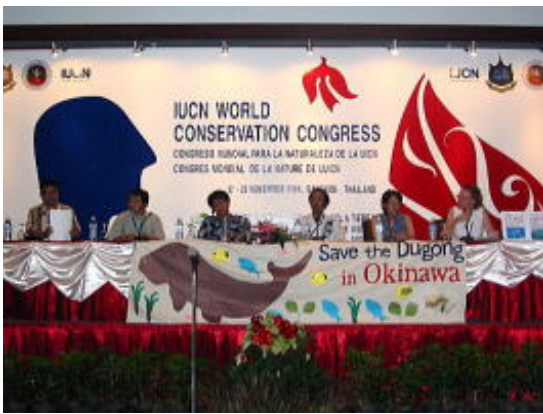
IUCN World Conservation Conference

Despite international pressure, the US government and military continue to refuse to recognize and take responsibility for their roles in the construction plan. Their refusal underlines the gravity of possible environmental destruction posed by construction of the base, thereby drawing further international attention to the plan. The Japanese government's unwillingness to request US government and military participation in the EIA further underlines potential problems associated with the construction plan.