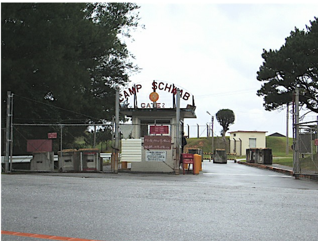
Entrance to Camp Schwab

The coalition is scrutinizing the institutional guidelines and the research conducted by the US government and military and the Japanese government as means of contesting environmental and cultural politics. It will examine the implications of the Japan Environmental Guide Standards (JEGS), which was created by the US government and military and the Japanese government in 2001 as the "sole source of guidance for environmental compliance, requirements, regulations, and standards for DoD activities and installations in Japan." [24] The JEGS recognizes the dugong as an endangered species. The coalition is also examining the implications of Final Report: Task 5 Cultural Historical, and Archeological Documentation, MCB Camp Smedley D. Butler and MCAS Futenma, Okinawa (1993) published by the US military. [25] The report documented the results of examination of documents and surveys on archeological, cultural and historical resources of Okinawa in relation to US bases on the island of Okinawa. It recognized the existence of cultural assets with scientific value in Camp Schwab, where the construction of the new base is planned.