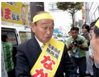
Nakaima Hirokazu on the campaign trail

As a local person involved in the effort to stop the construction of the base and to establish a protected area for the dugong in Henoko, I was certainly disappointed with the result of the election. Like many people here in Okinawa, however, I will continue to fight against the construction of the new base. The Japanese government is eager to foist its own interpretation of the election result on Okinawa, but the majority of Okinawans still oppose the construction plan. It is important to note that the gubernatorial election was won primarily on the issue of the economy with the victor not only downplaying the base issue but leaving ambiguous his own position on the issue. Moreover, the victory by the Democratic Party in mid-term elections in the US gives hope that a more environmentally accountable congress will emerge to confront a weakened Bush administration. Particularly significant is the fact that the international community of international environmental groups, scientists and concerned citizens now seek to hold the US government and military responsible for both the environmental and military consequences of the plan to construct the base at Henoko, one that would expand the US military reach throughout the Asia Pacific.