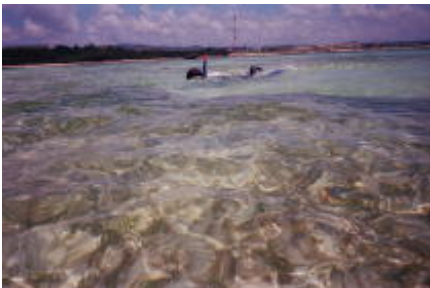
The dugong habitat with Camp Schwab in the background

In the face of determined efforts by the Japanese government to proceed with the construction plan, these efforts by the MoE have, however, been trivial. The publication of its reports went virtually unnoticed and ignored by the government. Thus, it is hard to see whether such efforts will help protect the dugong. At the same time, the Japanese government may seek to use the reports to protect itself against international criticism. When asked about its responsibilities, the Japanese government might argue that the MoE had been doing what it could do, but that the Okinawans had decided to accept the construction of the base in the dugong habitat despite the MoE warnings.