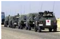
Japanese military convoy in Iraq

Few constraints remain on Japanese remilitarization. But there is one, and it is highly significant. The constitution states that "the right of belligerency of the state will not be recognized." Japan has a military. It will now have a Ministry of Defense. It now claims the right to send its military around the globe. But it doesn't have the ability to declare war and it doesn't have the authority to shoot to kill except in self-defense. Its military may be armed to the teeth, with the highest technology and lethal weaponry, but it is not authorized to pull the trigger. It can't kill. For the present, Japan's forces overseas are restricted to noncombat roles.