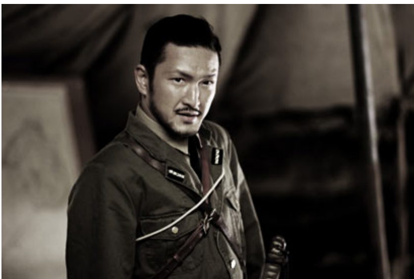
Ito played by Nakamura Shido

And some of the figures are fascinating. Kuribayashi (Watanabe Ken) had studied in the United States, wrote loving letters to his son with comic illustrations, and protected his men against abusive officers; his close associate, Baron Nishi (Ihara Tsuyoshi), was a gold medalist at the Los Angeles Olympics and a friend of Mary Pickford and Douglas Fairbanks. These two are in conflict with more traditional officers like Ito (Nakamura Shido), who seem more concerned with achieving a glorious suicidal death than defending the island and thus delaying the Allied forces' march on Tokyo. Under Kuribayashi's unconventional command, a garrison that was supposed to fall in 5 days lasted for 36. (The result was that just 1,083 of Japan's 22,000 troops from army and navy units survived. The United States suffered the highest casualties of the Pacific War to that time. The 70,000 Marines thrown into the battle suffered 26,000 casualties including 6,821 deaths.)