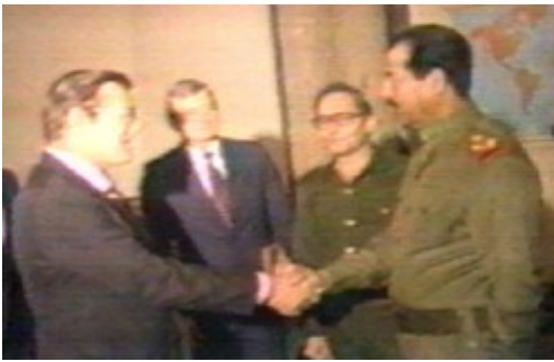
Saddam Hussain and Donald Rumsfeld in 1983

The consequence of the King's trial was a republic – the Commonwealth of England, declared on 17th March 1649. The House of Commons was henceforth “the supreme authority of this nation, the representatives of the people in parliament.” It was to be the only authority – the House of Lords was abolished as a “useless and dangerous body.” With abolition of the Star Chamber, the King's own “kangaroo court,” came the end of torture: it was never again inflicted.