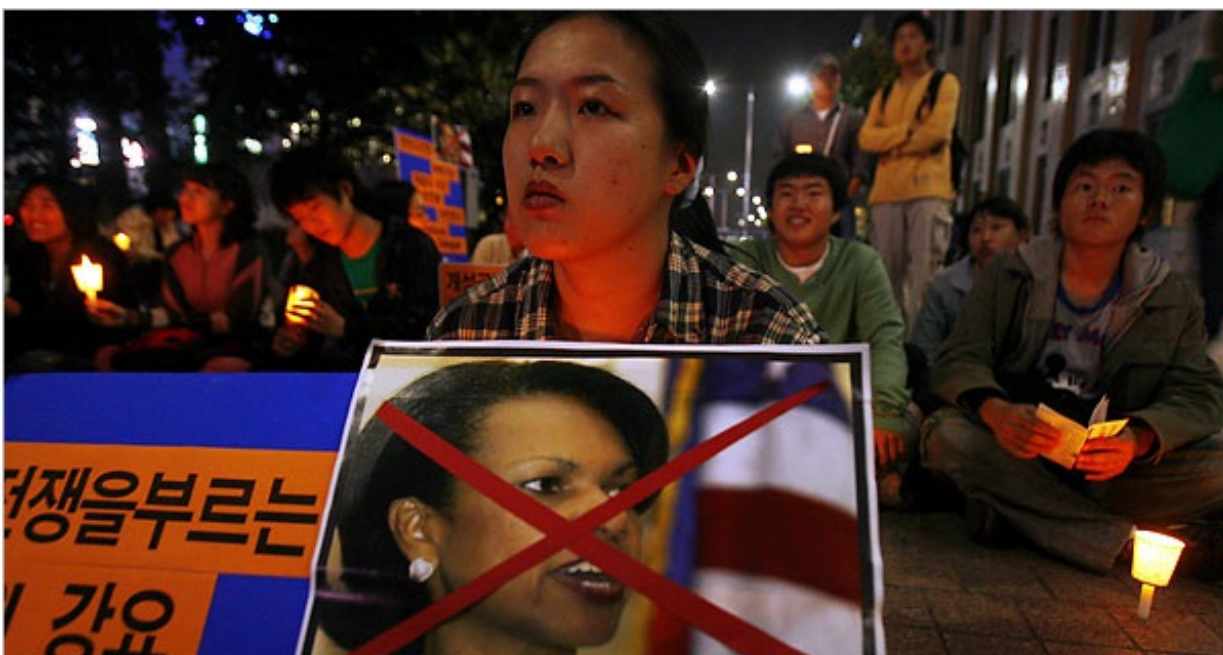
South Korean youth demonstrate against Condoleezza Rice's message