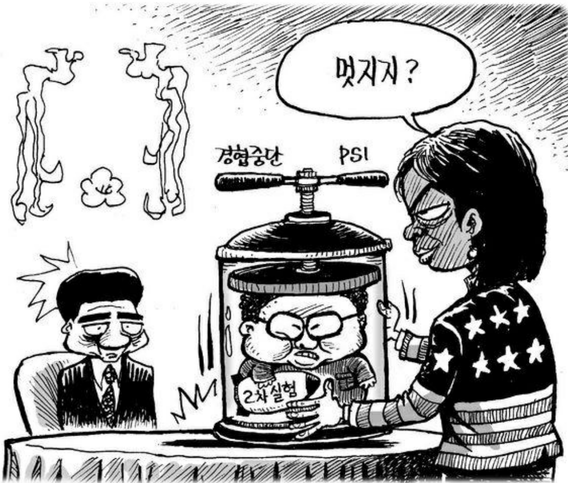
Figure 1 Condoleezza Rice places Kim Jong Il in a pressure cooker. Hangyore.