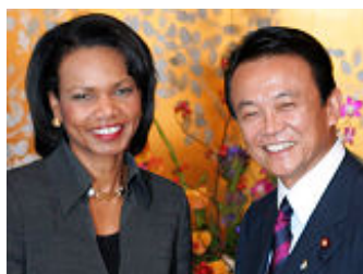
Rice in Japan with Foreign Minister Aso Taro.

Thus, via this last factor, the United States has continuing and unique ability to influence Pyongyang's decision on when and if the DPRK conducts more nuclear tests.