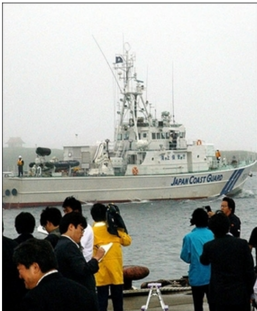
A Japan Coast Guard ship leaves for the disputed area in August 2006.

In August 2006, Japan-Russia relations were strained when a Russian patrol fired warning shots at a Japanese fishing boat, killing a member of the crew. The boat was near disputed islands—what the Japanese call the Northern Territories and the Russians call the Southern Kuriles. The incident occurred in the 50th anniversary year of the Japan-Soviet Joint Declaration (signed on October 19, 1956, and in effect from December 12 of that year). It was a powerful reminder of a lingering territorial problem, which has been the major obstacle preventing the two countries from signing a post-World War II peace treaty, as well as a continuing source of conflict.