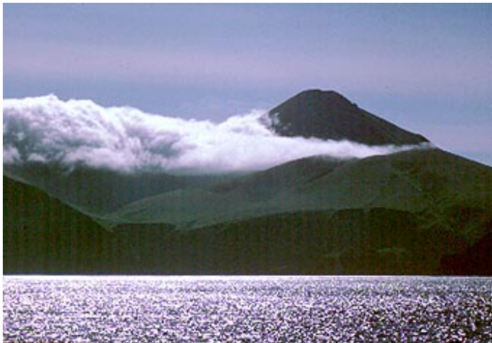
a collaboration of American, Japanese and Russian scientists studying life in the Kuril Archipelago, including the Northern Territories/Southern Kuriles.

The plan was derailed, with Japan's MoFA banning photographers from going to the Northern Territories , but the Russian move indicates that Japan will eventually have to improve its relations with Russia. Dominated by mountains and the sea, Kunashiri and Etorofu have a similar natural environment to that of the Shiretoko Peninsula in Hokkaido. Since Shiretoko, now a World Heritage site, attracts many Japanese during their summer holidays, once the political climate allows, they may also head for Kunashiri and Etorofu in droves.