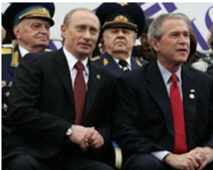
Putin and Bush in Moscow in May 2005

Last May, Moscow hosted an international gathering to commemorate the 60th anniversary of the end of the Second World War (Germany surrendered in May 1945). The ceremonies were attended by the leaders of the nations that comprised the Second World War Allies, including U.S. President George Bush and almost all the other heads of the G8 nations, as well as Chinese President Hu Jintao. This gathering on the 60th anniversary of the end of World War II also illustrated to the world that former mortal enemies Russia and Germany had achieved a historic reconciliation and a close strategic partnership. And this ceremony of reconciliation between Russia and Germany, based on the emergence of multipolarity, was actually carried out with Bush as a participant .