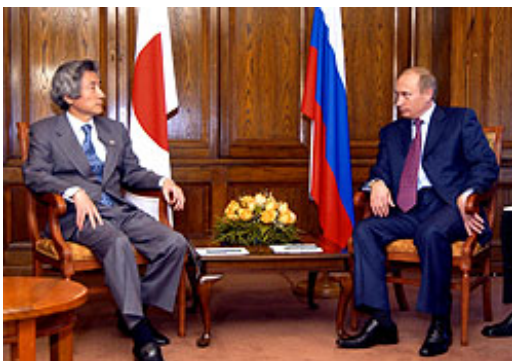
Koizumi and Putin meet in Chile in November 2004.

At first, Putin thought that the gathering could serve as a ceremony of reconciliation not only with Germany, but also with Japan, another defeated nation in World War II. Putin's Russia seeks to fund its national development by selling oil or natural gas to the countries of the West or Asia, so reconciliation with Germany was desirable in terms of expanding sales routes for energy. Around the time that Putin invited Prime Minister Koizumi Junichiro to the commemorative gathering in Moscow, he also tried to restart talks on the Northern Territories issue .