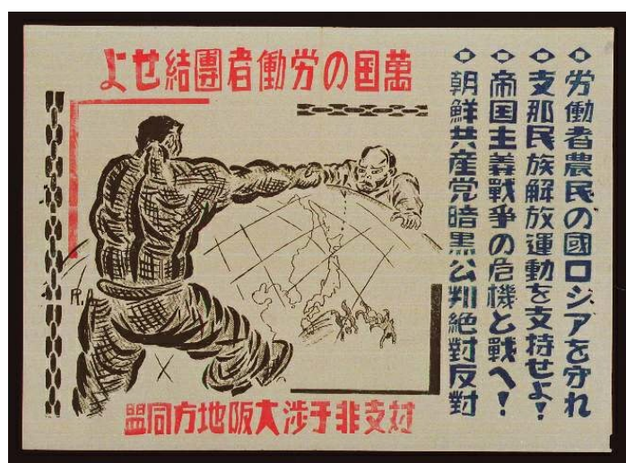
Call to action

The origins of the antimilitarism and anti-imperialism that continue to motivate the opposition of most Japanese people to rearmament, and to participation in 21st-century imperial adventures, precede by several decades the nation’s defeat in World War II, and date back more than a century to a time when Japan was still a rising military and industrial power. In 1901 radical journalist Kotoku Shusui published his prophetic and grimly titled essay Nijisseiki no kaibutsu teikokushugi (Imperialism, the Monster of the Twentieth Century). In 1904 a pacifist poem written by Yosano Akiko struck a forceful note of antiwar sentiment at the very height of Japan’s victorious war with Russia. By the 1920s, antimilitarism and antiwar activism in Japan formed a part of vigorous movements for profound social change—among them a labor movement, women’s movement, students’ movement, peasants’ movement, and a movement for the emancipation of social outcasts. Dissident artists and writers of this culturally and politically exuberant era were producing a wealth of posters, paintings, poems, plays, and prose with antimilitarist, anti-imperialist, and anti-capitalist themes. Representative of antiwar literature of the period was Kitagawa Fuyuhiko’s acclaimed 1929 poetry collection Senso (War). [1]