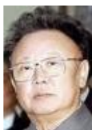
North Korean Leader Kim Jong Il

In a politically-charged atmosphere of the upcoming mid-term congressional elections, on October 4, 2006, Christopher R. Hill, the assistant secretary of state for East Asian and Pacific Affairs, reiterated the long-standing U.S. official position in a speech at the newly created US-Korea Institute at John Hopkins University "We are not going to live with a nuclear North Korea, we are not going to accept it." (3) The United States made clear that it would not let Pyongyang's nuclear challenge undermine American nuclear hegemony, put in doubt the U.S. nuclear guarantees to the allied states against nuclear threats from nuclear powers, mock Washington's promise to halt the spread of nuclear weapons to local enemies, further damage the nuclear nonproliferation regime, and weaken U.S. leadership in Northeast Asia. But, on October 9, 2006, the DPRK called the U.S. bluff. (4)