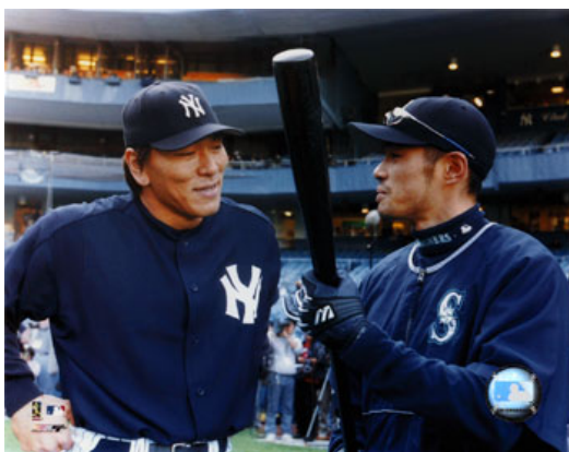
Hideki Matsui and Ichiro Suzuki

The success of players like Ichiro Suzuki and Hideki Matsui in the United States has once again demonstrated the power of sport in crossing national borders. With their stirring performances on America’s baseball diamonds, these imported players have helped to create vast new markets for Major League baseball in Japan, while teaching Americans that there is a new and very different way to approach their own national pastime. More importantly, the accomplishments of these athletes have served to influence the way many Americans and Japanese look at each other, and raised anew questions about the role of culture in sport.