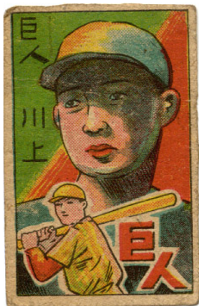
Tetsuharu Kawakami baseball card

Self-sacrifice, one might say, is a rather more complex disposition than that of a ‘cardboard samurai’—and rather more like definitions of effort familiar to athletes in the United States and elsewhere. [20]