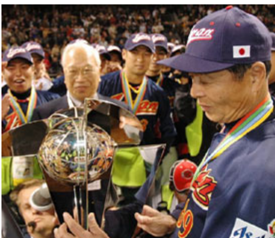
Sadaharu Oh at WBC 2006

Indeed, the smooth, much-praised performance of Team Japan in WBC 2006, an event that was widely watched in Japan, caused many Japanese baseball experts to conclude that after all, their way was best. The manager of Team Japan was none other than the aforementioned Oh, a man whose name was synonymous with backbreaking workouts during a storied career in which he hit 868 home runs.