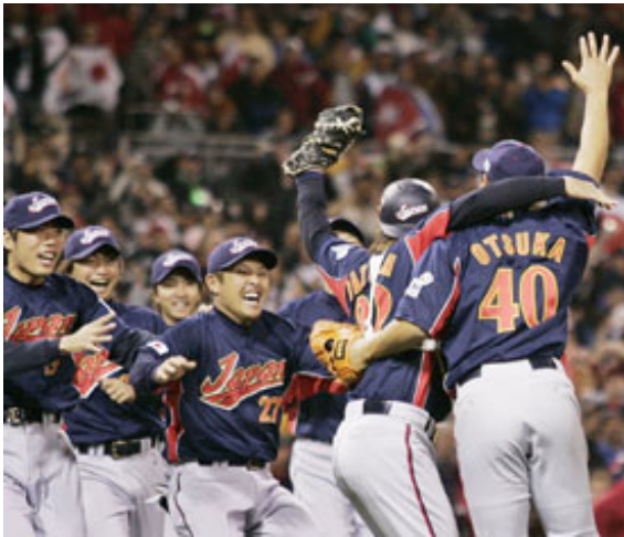
The Japanese team after winning WBC 2006

The Asahi Shimbun summed up the impact of these events in Japan by editorializing, "Japanese were once seen in the US as a 'faceless' people obsessed with exporting cars and consumer electronics. The excellent play of the Japanese baseball players and their positive personalities have changed the American image of the Japanese." [2] Team WBC certainly helped solidify that new image.