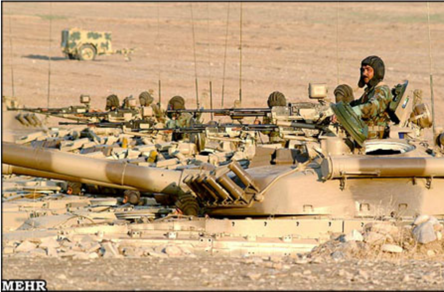
MEHR Iranian Missile Exercise

crises arise in North Korea, Iran, Taiwan...or Venezuela. Trends which increase the limits of technology in warfare are not only applicable to relations between nations but also to groups within them—ranging from small conspiratorial entities up the scale of size to large guerilla movements. The events in the Middle East have proven that warfare has changed dramatically everywhere, and American hegemony can now be successfully challenged throughout the globe.