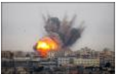
Israeli missiles target Beirut

This is the message of the conflicts in Gaza, the West Bank, and Lebanon—to use only the examples in today's papers. Walls are no longer protection for the Israelis—one shoots over them. Their much-vaunted Merkava tanks have proven highly vulnerable to new weapons that are becoming more and more common and are soon likely to be in Palestinian hands as well. At least 20 of the tanks were seriously damaged or destroyed.