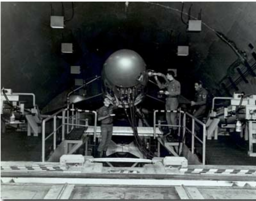
Members of the U.S. Air Force's 71st Tactical Missile Squadron check a nuclear-capable Mace MGM-13B missile on its launcher in a steel and concrete underground hanger at Ramstein Air Force base in Germany, 1968. The Mace's W-28 thermonuclear warhead had an explosive yield of 1.1 megatons.

Declassification decisions on U.S. nuclear weapons information by federal agencies have taken a surprising turn. Security reviewers are treating as "classified" information that has been available in the public record for decades. For years during the Cold War the U.S. nuclear arsenal included 1,000 Minuteman and 55 Titan II missiles; this information could easily be found in a variety of public record sources. For reasons that are truly perplexing, when the current reviewers open up archival documents from the Cold War, they are redacting those and other publicly-available numbers, even to the point of classifying parts of a public report by the Secretary of Defense [see examples in Part II]. Excessive secrecy continues to abound in another category of historical nuclear information: the overseas deployment of U.S. nuclear weapons during the Cold War. Information on the deployments that has been publicly available for many years is also being classified by U.S. government agencies.