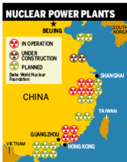
Chinese nuclear power plants

India intends to go from just under 3 gigawatts to 20 gigawatts by 2020 with the addition of 31 plants, mostly in the west where much of its heavy industry lies.