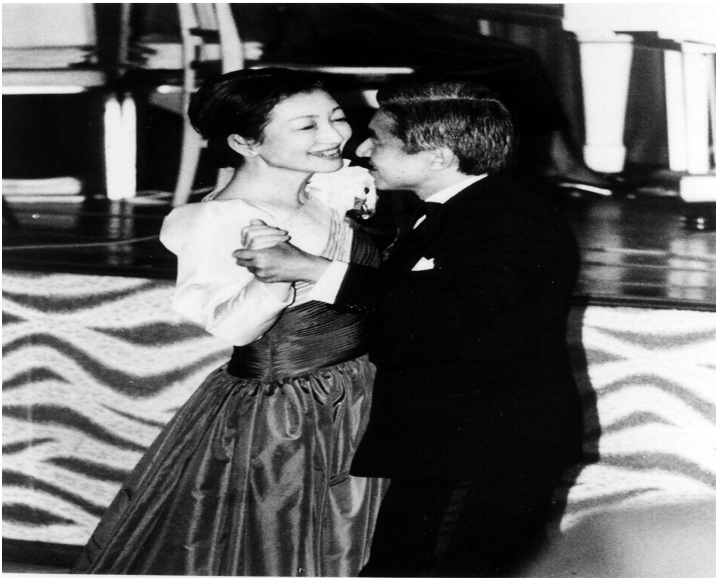
Emperor and Empress at the Foreign Correspondents Club of Japan, 1985