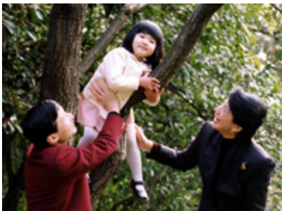
Crown Prince Noriito, Princess Masako, and daughter Aiko