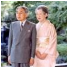
Emperor and Empress: Formal portrait

Was this precaution necessary? Everything, from my query, submitted weeks in advance, to his majesty's written reply had been carefully scripted and vetted by IHA bureaucrats. The whole episode capped to us foreign observers a slightly farcical 60 minutes: journalists asking mostly anodyne questions about their majesties' health and their impressions of Ireland and Norway before wishing them a safe trip; the sight of 40 heads leaning forward to catch the Empresses' whispered replies, which could hardly be heard by anyone in the room.