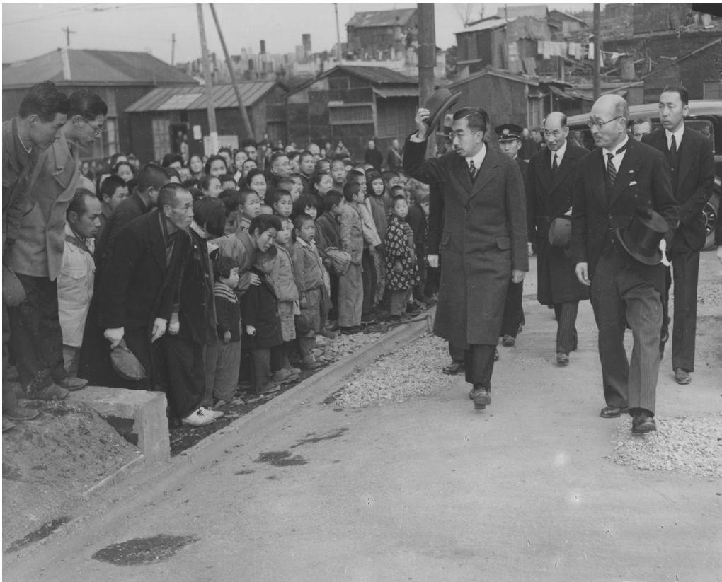
Emperor Hirohito going to the people, 1946

There is no question that the institution is popular. An Asahi Shimbun survey in April 1997, for example, found 82 percent wanted the monarchy to continue with just 8 percent in favor of abolishing it (contrast this with support for the British monarchy which has fallen, according to one poll below 50 percent; see sidebar). Ken Ruoff, author of The People's Emperor , says polls throughout the postwar period have shown similar results. "Those are remarkable polls," he says. "Most politicians would be very happy to get results like that."