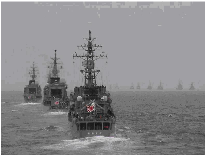
Japan's coast guard in the East China Sea

Japan has been competing over scarce energy resources with China. The two energy-hungry Asian powers have been locked in a simmering dispute over gas reserves in the East China Sea. Furthermore, they have each lobbied hard for alternative routes for a pipeline from eastern Siberia's oilfields to Pacific Rim nations. The Sino-Japan rivalry over energy resources shows signs of spreading to the Middle East.