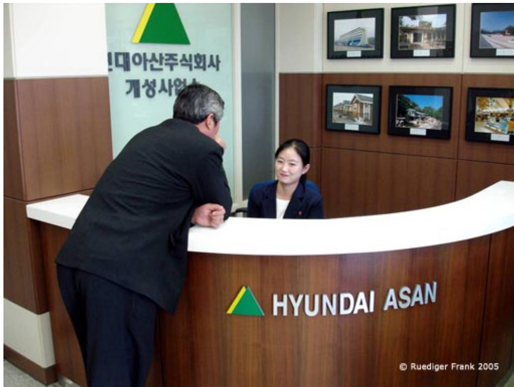
North Korean Employees at Hyundai Asan's Office in Gaeseong

The logical consequence is the urgent need for modernization, the introduction of advanced technology, securing a stable energy supply, the import of capital and the development of an institutional and human resource capability to interact on the international scene. This is behind Pyongyang's focus on intensified economic training measures for its officials, and the background of the recent news about eased regulations for direct investment in North Korea (Hankook Ilbo, 2005-11-30). This is even more so since normalization with Japan and the expected financial support related to that deal are not out of reach, but still too far away.