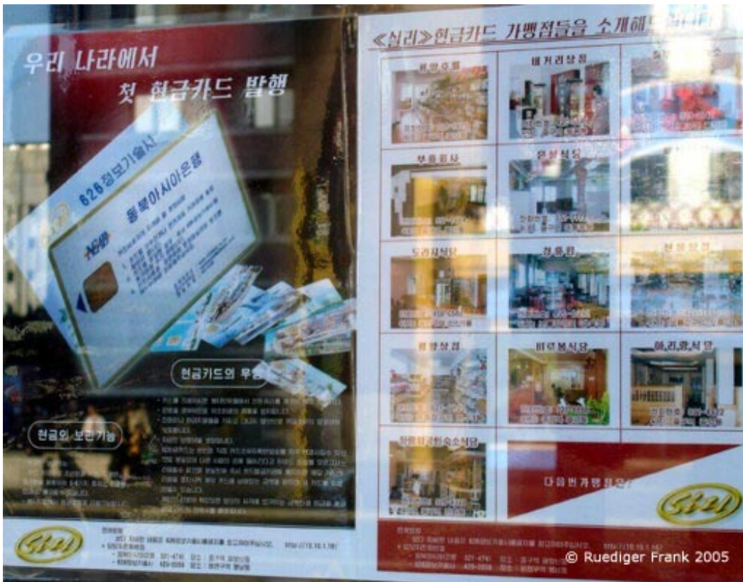
North Korea's First Debit Card

At present it can only be used in roughly a dozen shops and restaurants. Still, this is a beginning. Some traders were ready to bargain, which implies private economic activity or at least growing flexibility. In one small but nicely arranged shop, NOT in the vicinity of a hotel, I found "Chanel" handbags at a very reasonable price, tags written in Korean but prices given in US Dollars. The same currency, not the Euro, is required to purchase a ticket at the Air Koryo office in Beijing. A North Korean official asked me to send him English-language economics textbooks for his daughter who studies at Kim Il-sung University, and would not mind if I sent him the books via ordinary mail. This list of examples can be continued.