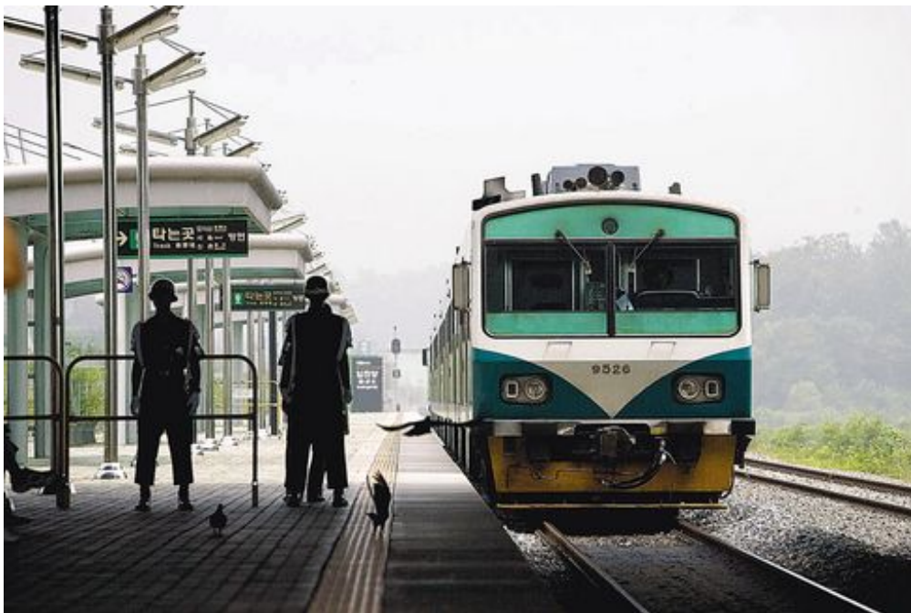
A train at Imjingak Station near the DMZ

"The North Korean side said in a telegram that it is no longer able to conduct the railway tests as scheduled because of the lack of a military agreement to guarantee the safety (of people taking part) in the trial runs and unstable conditions in the South," Shin told the news briefing.