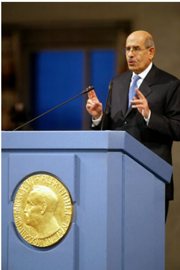
Mohamed ElBaradei delivering his Nobel Lecture in the Oslo City Hall, December 10, 2005.

Mohammed ElBaradei, Director-general of the International Atomic Energy Agency (IAEA), has described as “unworkable” the way of thinking that it is “morally reprehensible for some countries to pursue weapons of mass destruction yet morally acceptable for others to rely on them for security and indeed to continue to refine their capacities and postulate plans for their use.” [1] While he did not spell out particular countries, the nuclear superpowers plainly fill the category of countries that “rely on..., refine..., postulate plans for” use of nuclear weapons, while they undoubtedly see as “morally reprehensible” the attempt of other countries, notably North Korea and Iran, to do likewise. While plainly hypocritical, the former is the position of the United States (and its allies, such as Japan).