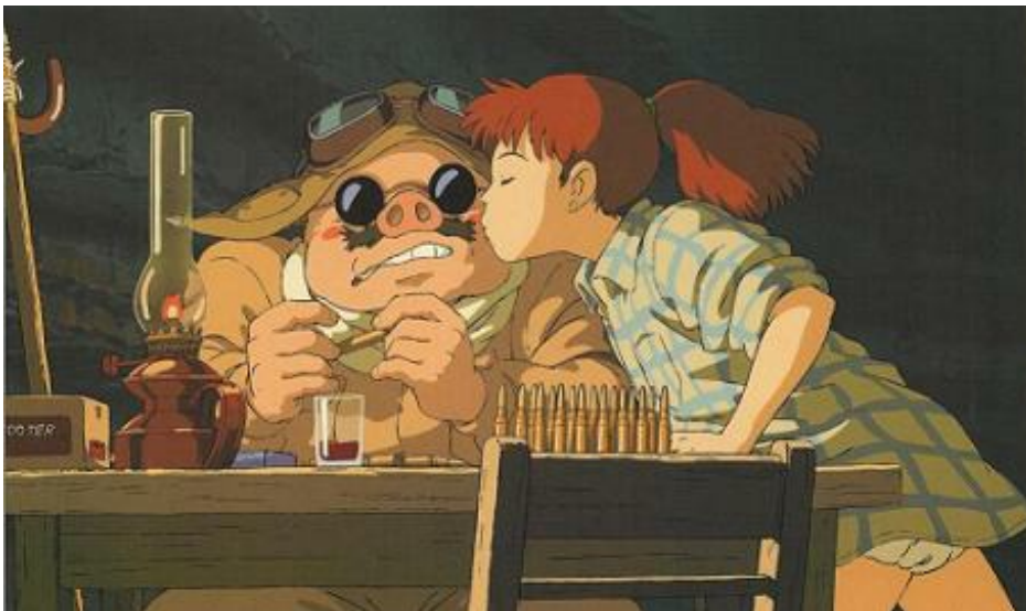
A scene from Porco Rosso

Miyazaki's movies are threaded with other personal obsessions, just as samurai imagery pervades Kurosawa's work. Pigs, for example, turn up in many films. ("The behavior of pigs is very similar to human behavior," Miyazaki has said. "I really like pigs at heart, for their strengths as well as their weaknesses.") A 1992 film, "Porco Rosso," tells the story of a pig that flies—he's a pilot who works the skies over the Adriatic before the Second World War. In one tender scene, the pig recalls the air battle in which his fellow flying aces just kept ascending—floating ever upward into a cold empyrean death—while he, a more earthbound creature, could not face such self-sacrifice. Next month, Disney, the American distributor of Miyazaki's films, will release a video version of "Porco," whose title character will be voiced by Michael Keaton. It will also make available an English version of "Nausicaä," with voices by Uma Thurman and Patrick Stewart. With these two releases, the entirety of Miyazaki's eccentric output will be available in good English versions for the first time.