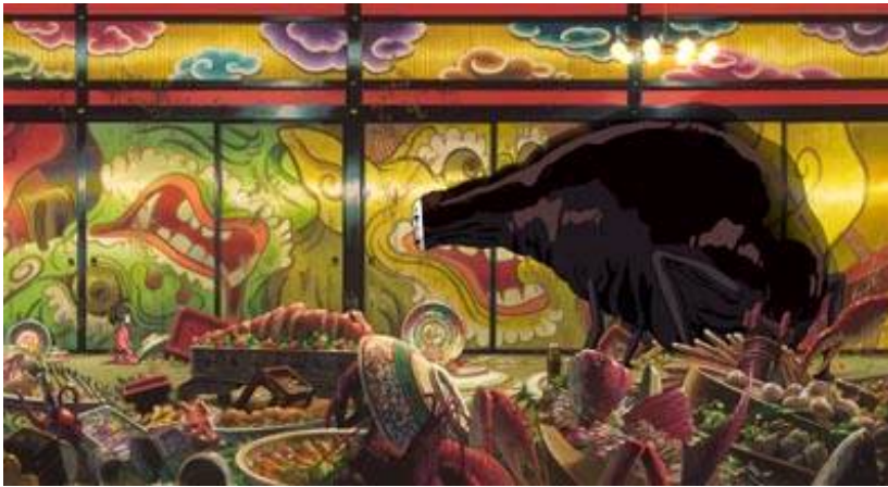
Chhiro encounters No Face in Spirited Away .

Even Miyazaki's most outlandishly imagined creatures have an unnerving realism. The eerie, poignant No Face in " Spirited Away " is a creature who wears a mask, whimpers softly, and eats everything in sight, greedily eager for communion with others; he glides along like an inky rain cloud, and expands just as ominously. In the same film, a flock of white paper birds flash through the sky: they are like origami, only sharp-edged, and capable of drawing blood.