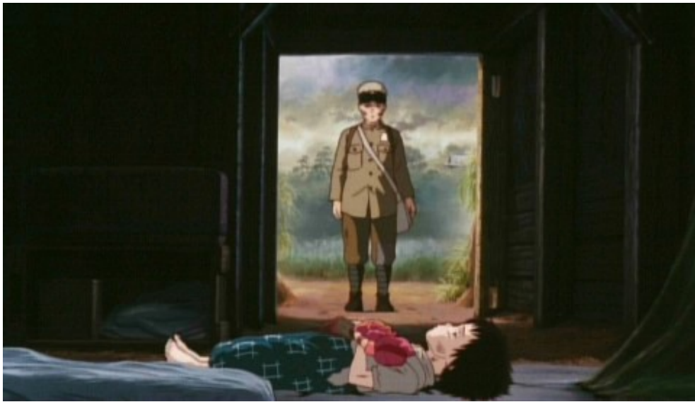
A scene from Grave of the Fireflies

For many viewers, of course, surrendering to Miyazaki is a pleasure. Weeks after I saw “ Spirited Away ,” I was still thinking of the scene in which Chihiro takes a train trip, in the company of No-Face, to seek out a witch who may help her save her friend. The sequence is both emotionally precise and fantastical. It’s like every solitary journey you’ve ever taken, when you felt lonely and a little exalted, but it is also deeply strange, for the train glides, stately and surreal, over a translucent blue sea, while the sky slowly ripples through the possibilities of a sunset, from the pink of crushed petals to a soft, forgiving black.