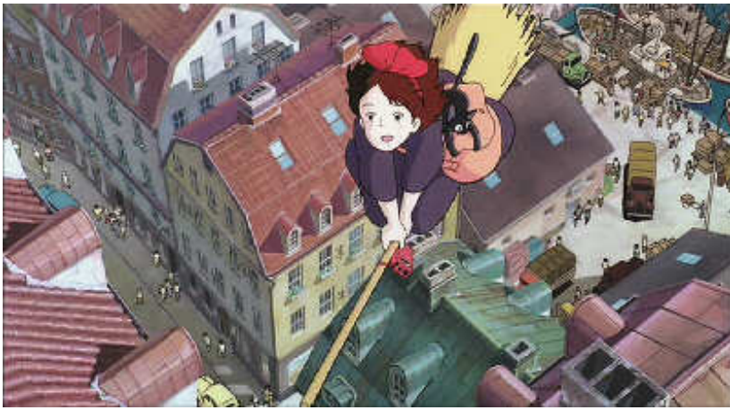
A scene from Kiki's Delivery Service

Even Miyazaki's most outlandishly imagined creatures have an unnerving realism. The eerie, poignant No Face in " Spirited Away " is a creature who wears a mask, whimpers softly, and eats everything in sight, greedily eager for communion with others; he glides along like an inky rain cloud, and expands just as ominously. In the same film, a flock of white paper birds flash through the sky: they are like origami, only sharp-edged, and capable of drawing blood.