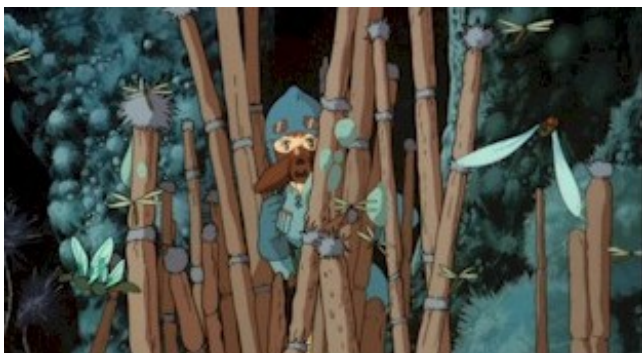
A scene from Nausicäa of the Valley of the Wind

Miyazaki's films are also striking for their preoccupation with the environment, and their not entirely metaphorical suggestion that the natural world is capable of remembering what's been done to it. (He believes that we harbor "memories in our DNA from before we took the form of humans.") "Nausicäa of the Valley of the Wind" (1984) is set in a post-apocalyptic world where humans live huddled on the edge of a toxic forest. Its heroine finds beauty in the lush, strangely colored undergrowth and the giant cicada-like insects that dwell there, nursing a grudge against the humans who've poisoned their habitat.