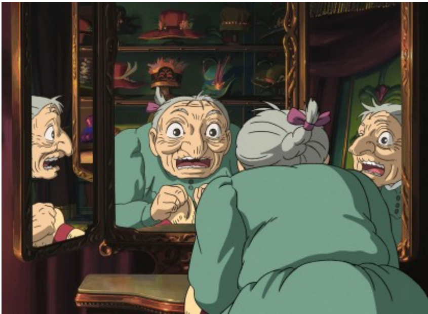
Sophie in Howl's Moving Castle

Miyazaki puffed on a cigarette. "Some people may say this girl is a lot like Chihiro. Maybe. But I don't fear that. I think I'd lose a lot more by trying to avoid repeating myself than by just repeating myself. Some people are always trying radically new material. I know what I want, and I'll continue with it." He went on, "I don't have much patience for calculating and intellectualizing anymore. It has to do with the times. Nobody knows everything. Nobody knows what's going to happen. So my conclusion is, don't try to be too smart and wise. Why does anybody feel the way they do? Why is somebody depressed? Or angry? Even if you have a therapist, you're never going to figure it out. You're not going to solve it. Besides, every trauma is an important part of you."