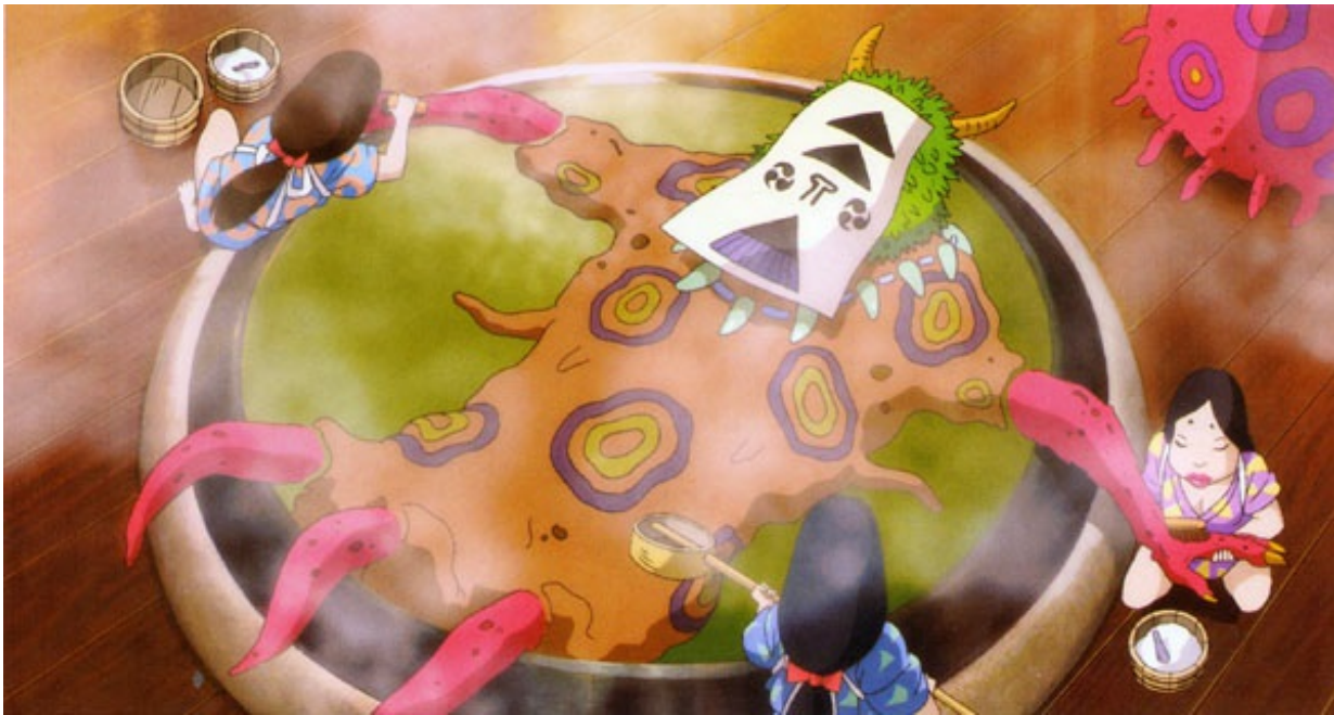
A scene from Spirited Away

Miyazaki's movies are threaded with other personal obsessions, just as samurai imagery pervades Kurosawa's work. Pigs, for example, turn up in many films. ("The behavior of pigs is very similar to human behavior," Miyazaki has said. "I really like pigs at heart, for their strengths as well as their weaknesses.") A 1992 film, "Porco Rosso," tells the story of a pig that flies—he's a pilot who works the skies over the Adriatic before the Second World War. In one tender scene, the pig recalls the air battle in which his fellow flying aces just kept ascending—floating ever upward into a cold empyrean death—while he, a more earthbound creature, could not face such self-sacrifice. Next month, Disney, the American distributor of Miyazaki's films, will release a video version of "Porco," whose title character will be voiced by Michael Keaton. It will also make available an English version of "Nausicaä," with voices by Uma Thurman and Patrick Stewart. With these two releases, the entirety of Miyazaki's eccentric output will be available in good English versions for the first time.