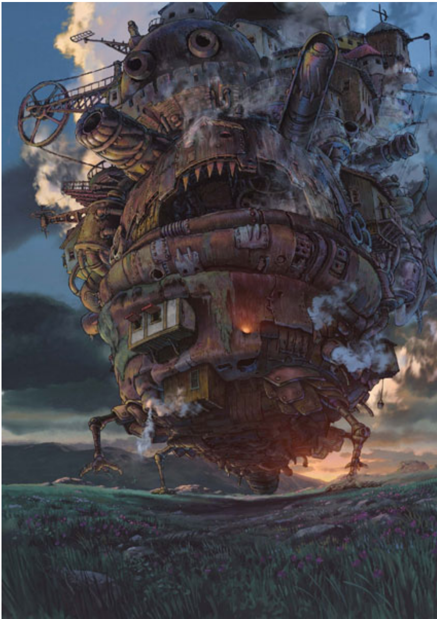
From Howl's Moving Castle

But it wouldn't be quite right to describe Miyazaki's approach as wholly Japanese. As with fantasy writers in the British tradition, from C.S. Lewis to J.K. Rowling, Miyazaki makes the details of the worlds he creates concrete and coherent, so that we might better suspend our disbelief for the big leaps of fantasy. This devotion to realism, Suzuki acknowledges, "is rare in Japanese animation," which tends to revel in the freedom from earthly laws that the medium allows. Miyazaki can be steely in pursuit of this goal. In a Japanese television documentary about "Spirited Away," he is shown at a meeting with his young staff, explaining how they are to draw certain images based on his storyboards. "The dragon is supposed to fall from down the air vent, but, being a dragon, it doesn't land on the ground," Miyazaki says. "It attaches itself to the wall, like a gecko. And then—ow!—it falls—thud!—it should fall like a serpent. Have you ever seen a snake fall out of a tree?" He explains that it "doesn't slither, but holds its position." He looks around at the animators, most of whom appear to be in their twenties and early thirties. They are taking notes, looking grave: nobody has seen a snake fall out of a tree.