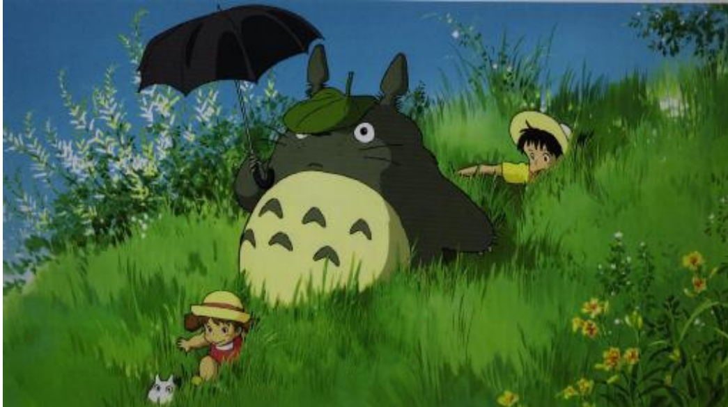
A scene from My Neighbor Totoro

The tone of the film is dreamy and playful—it has the sun-soaked colors and languid pace of a summer afternoon in the country—but the way it melds such elements with a subtle psychological treatment of the children's anxiety over their mother makes it a radical film. When four-year-old Mei learns that her mother won't be coming home for a visit as planned, her grief takes the form of a tantrum. She howls—her mouth a black cavern, her arms stiff. (In Disney movies, children weep decorously or break into poignant song.) Satsuki, panicked and struggling to be the mature sister, shouts at her not to be so "stupid"; Mei runs away to the hospital to find her mother. Both girls are ultimately rescued by the cat bus, which opens up a warm, golden, womb-like interior to them—an entrancing image of solace—and bounds across the countryside to return them to their father. Miyazaki is a master at conveying emotions as a child would experience them: obliquely, often physically, with a thread of magical thinking that promotes resilience.