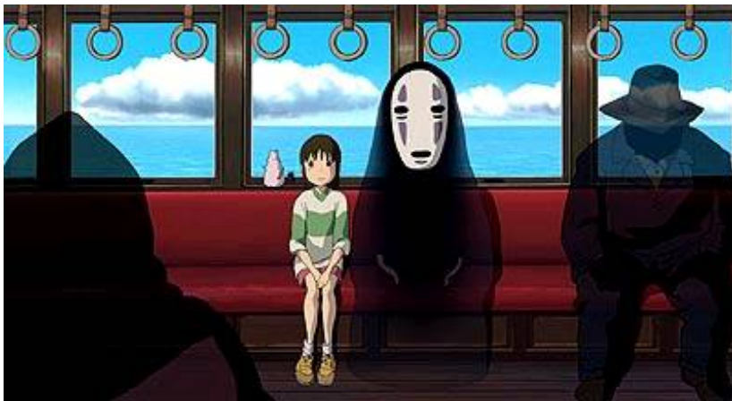
A scene from Spirited Away

For many viewers, of course, surrendering to Miyazaki is a pleasure. Weeks after I saw “ Spirited Away ,” I was still thinking of the scene in which Chihiro takes a train trip, in the company of No-Face, to seek out a witch who may help her save her friend. The sequence is both emotionally precise and fantastical. It’s like every solitary journey you’ve ever taken, when you felt lonely and a little exalted, but it is also deeply strange, for the train glides, stately and surreal, over a translucent blue sea, while the sky slowly ripples through the possibilities of a sunset, from the pink of crushed petals to a soft, forgiving black.