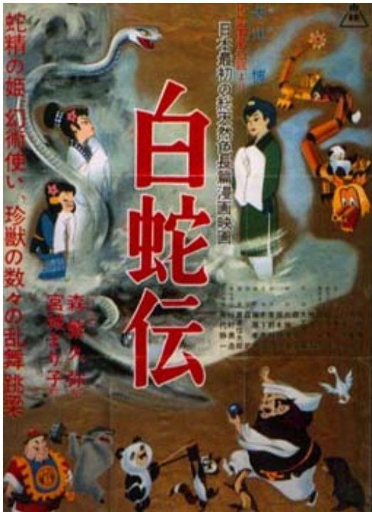
Poster for Legend of White Snakes

At Gakushuin University, in Tokyo, Miyazaki studied economics and political science. But he also joined a children’s-literature group, where members read and discussed fantasy fiction. As a senior in high school, Miyazaki had sneaked out to see the first Japanese animated film made in color, “ The Legend of the White Snake ,” when he was supposed to be studying for his entrance exams. The film had a big impact on him, he wrote years later, because while he could see that it was “cheap melodrama,” its naked emotionalism touched him. “My soul was moved and I stumbled back home in the snow that had just started. Comparing my pitiful situation to the characters’ earnestness, I was ashamed of myself, and cried all night.” At the time, he had been trying to write a sophisticated, absurdist manga, but he realized, somewhat to his embarrassment, that he was more interested in creating something sincere.