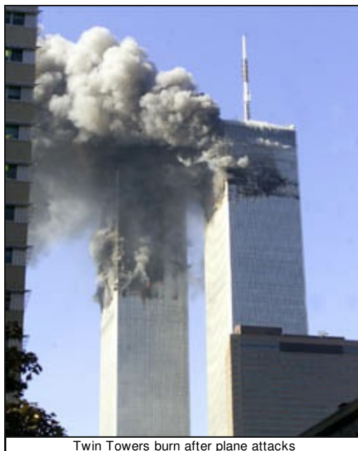
Twin Towers burn after plane attacks

It will be obvious to anyone who has viewed American media coverage of 9-11 and the subsequent war on terror that these events have given rise to a resurgent patriotism in the U.S. not seen since World War II (In this paper I use the American name for the war, World War II. Even in Hawaii, far from the mainland United States, houses along the streets of most neighborhoods routinely display American flags; stores sell flags, pins, and banners; and cars everywhere sport bumper stickers proclaiming national pride and unity. Whether swept up in this renewed patriotism, or worried by the concomitant rise of racism and unchecked militarism, nearly everyone has been affected.