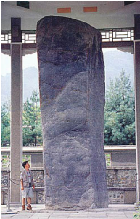
Figure 7: The King Kwanggaet'o stele in Ji'an, China