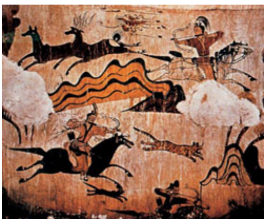
Figure 4 : A hunting scene in the Tomb Muyongchong, in Ji'an, located in contemporary Jilin Province, China.