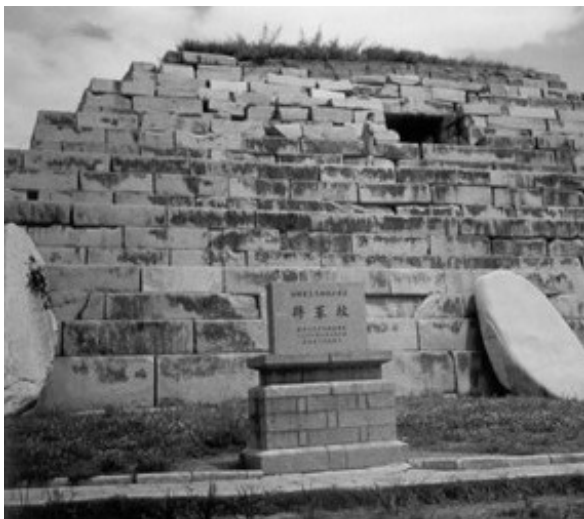
Figure 10: Tomb of King Changsu