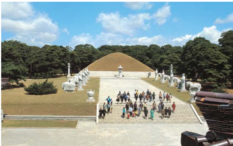
Figure 3: King Tongmyong's Mausoleum, North Korea