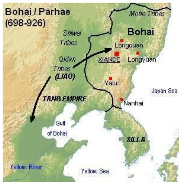
Figure 2: Map of Bohai/Parhae

"During the Sui and Tang, the Mohe lived along the Songhua and Heilong Rivers. In the second half of the seventh Century the Sumo-Mohe tribe grew stronger. At the end of the seventh century Da Zuorong, the leader of the Sumo, united all tribes and formed a government. Later the Tang Emperor Xuanzong proclaimed Da Zuorong King of the Bohai Commandery. After this proclamation, the Sumo-Mohe government called itself Bohai." [3]