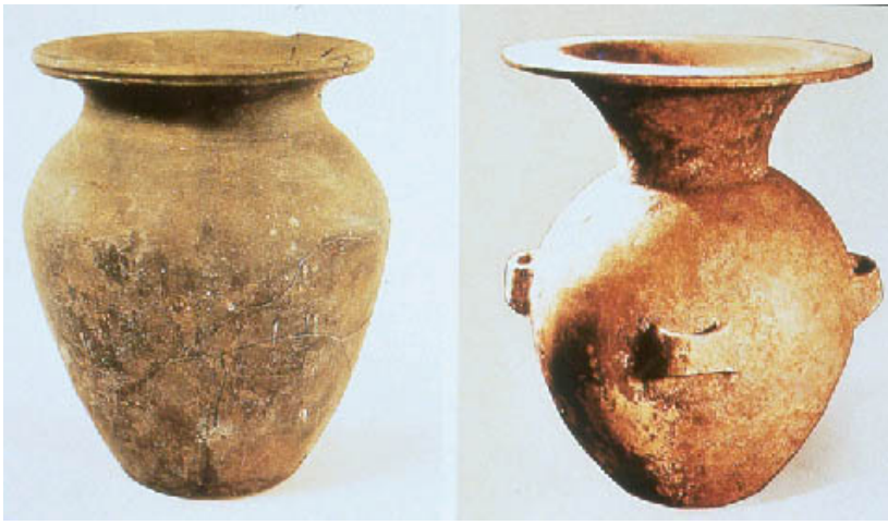
Figure 5: Jars excavated on Mount Mandal, Pyongyang, North Korea.

Koguryo's relics are highly regarded in the rivalry between China and Korea. This indicates that heritage constitutes an influential part of cultural hegemony in East Asia and also, a powerful part of the cultural and historical patrimony of the people, both in Korea and especially in the Northeast Provinces in China. Kang Hyun-sook (2004), professor of Ancient Art in South Korea, maintains the distinctiveness and influence of Koguryo culture in East Asia in underlining that the Koguryo tombs with murals were not mere imitation of their Chinese counterparts and that they were influenced by Japan's funerary culture. As examples of Koguryo's influence on Japan's funerary culture, the Takamatsu Tomb and the Kitora Tomb in Japan have been cited. [31] She concludes that the influence of Koguryo seen in Japan and the Korean peninsula demonstrates its prominent position as a culturally powerful regional state (Kang 2004: 106-107). As such, the Koguryo archaeological remains represent the legacy and hegemony of regional culture.