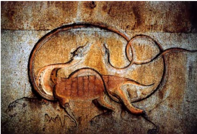
Figure 6: A snake crossed with a tortoise. Kanso Middle-sized Mound, 7th Century in the Kitora Tomb in Asukamura, Nara prefecture, Japan.

Koguryo's relics are highly regarded in the rivalry between China and Korea. This indicates that heritage constitutes an influential part of cultural hegemony in East Asia and also, a powerful part of the cultural and historical patrimony of the people, both in Korea and especially in the Northeast Provinces in China. Kang Hyun-sook (2004), professor of Ancient Art in South Korea, maintains the distinctiveness and influence of Koguryo culture in East Asia in underlining that the Koguryo tombs with murals were not mere imitation of their Chinese counterparts and that they were influenced by Japan's funerary culture. As examples of Koguryo's influence on Japan's funerary culture, the Takamatsu Tomb and the Kitora Tomb in Japan have been cited. [31] She concludes that the influence of Koguryo seen in Japan and the Korean peninsula demonstrates its prominent position as a culturally powerful regional state (Kang 2004: 106-107). As such, the Koguryo archaeological remains represent the legacy and hegemony of regional culture.