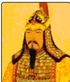
Figure 9: King Kwanggaet’o the Great

Last but not least, questions of gender are ignored in mainstream national historiography on Koguryo. National heroes are constructed as masculine: for example, the ancient historical figures like King Kwanggaet’o the Great and his son King Changsu are presented as a source of Korean national pride. Their conquests in the Northeast provinces are attributed to the victory of Korea’s virile “national masculinity”. Accordingly, in praising masculine achievement in history, women become invisible and images of male domination are reinforced.