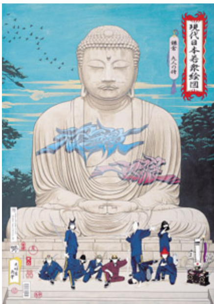
Hisashi Tenmyouya's work, described as "like Wu-Tang, but from a Japanese perspective," portrays Asian hip hop culture.

The innocent thrill of mixing nihonga with contemporary sensibilities is most apparent in Hisashi Tenmyouya's 2001 ukiyo-e -style print in acrylic, "Contemporary Japanese Youth Culture Scroll -- Para Para Dancing (Great Empire of Japan) vs. Break Dancing (America)." The scroll presents a face-off between Japanese hip-hop boys and para-para dancing girls. Once again the effect is humorous, prompting a suspicion that the attention given to such art may be short-lived.