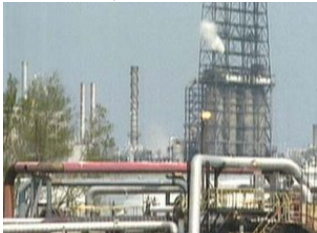
China-Iran Oil Deal