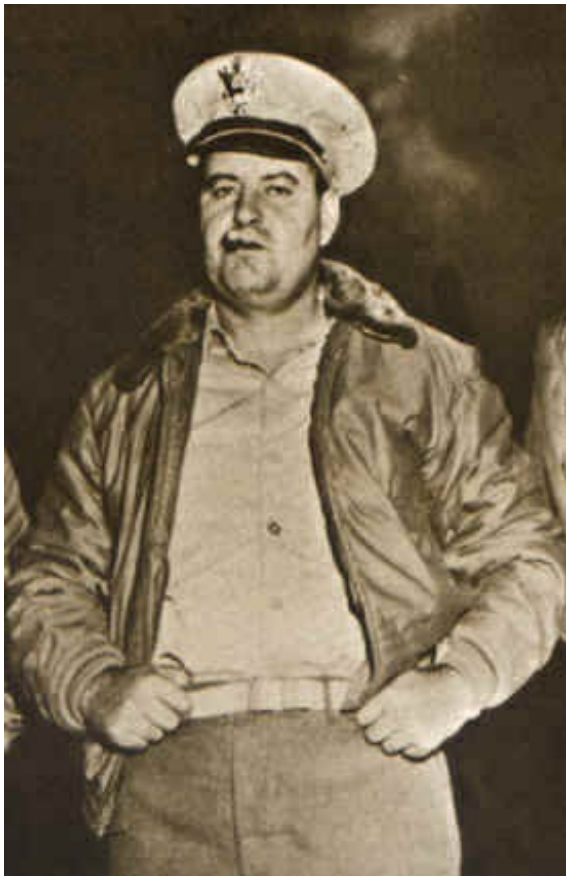
General Curtis LeMay