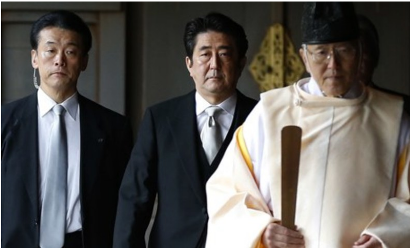
Abe (center) visiting Yasukuni Shrine

Abe's visit to the Yasukuni Shrine in December 2013 was only the climax of his career as a historical revisionist. It has been his declared objective to "overcome the postwar regime" and rectify the "distorted image" of Japan's wartime past rooted in Japanese society. The image that he is referring to, one widely shared not only by Japan's Asian neighbors but also by its patron and ally the United States, is that of Japan as an aggressor nation in the Asia-Pacific War (1931-45). For Abe, the war was rather one fought for the defense of Japan against the Western colonial powers and for the liberation of East Asia.