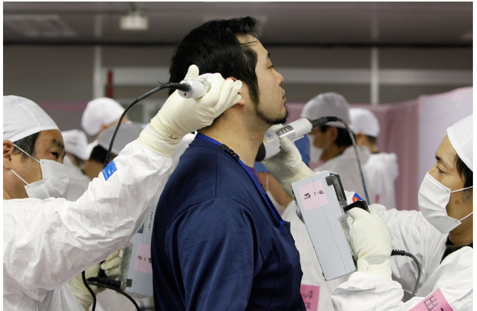
RADIATION RISKS: Workers are constantly screened for radiation as they work to permanently shut down the crippled Fukushima Daiichi nuclear power plant.

The work in the plant can also be dangerous. Six workers in October were exposed to radioactive water when one of them detached a pipe connected to a treatment system. In August, 12 workers were irradiated when removing rubble from around one of the reactors. The accidents prompted Japan’s nuclear regulator to question whether Tepco has been delegating too much.