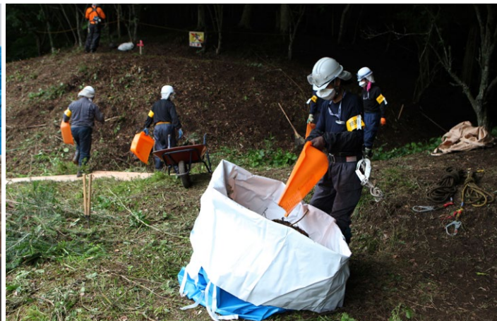
DECONTAMINATION: Thousands of workers are picking up radioactive debris in towns and villages around Fukushima prefecture and storing them in huge blue bags, which for now are piling up along roadsides.

“The companies then hire their own employees taking into account our contract. It’s very difficult for us to go in and check their contracts.”