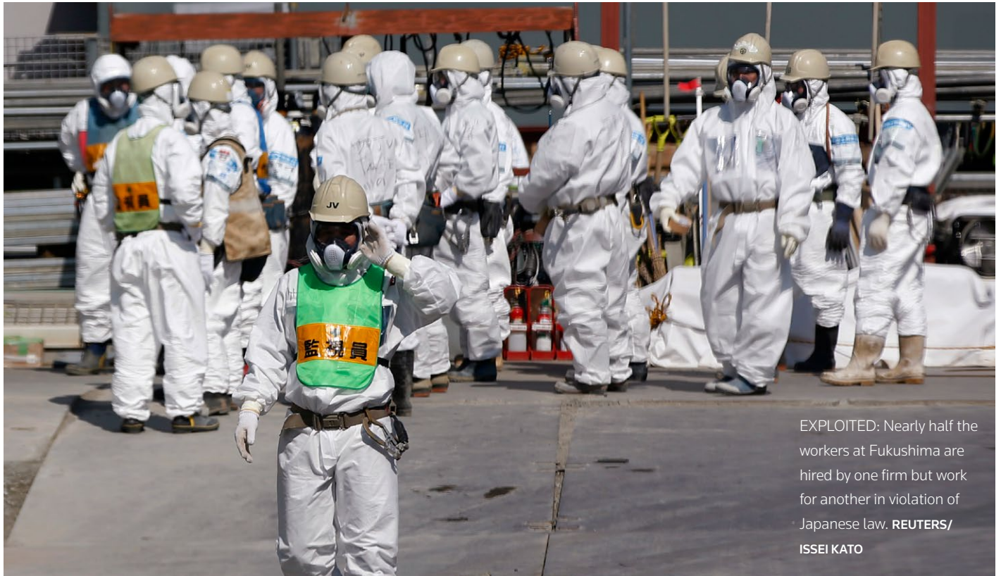
EXPLOITED: Nearly half the workers at Fukushima are hired by one firm but work for another in violation of Japanese law.

and scatter to distant hospitals, the workers said. Denko Keibi had no insurance for workplace accidents and wanted to avoid reporting the crash, they said.