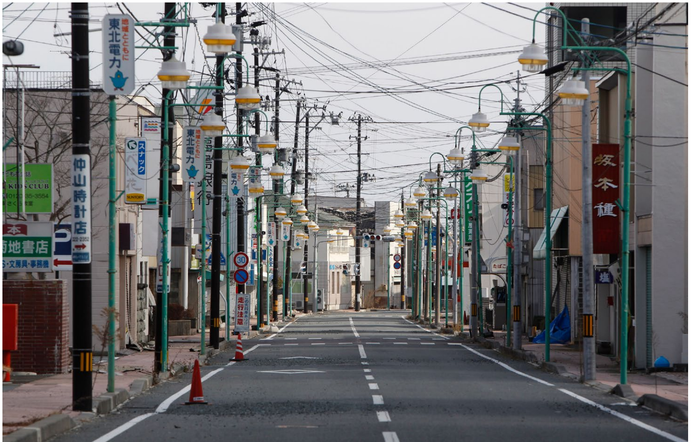
GHOST TOWNS: More than 150,000 people fled Fukushima prefecture after the March 2011 tsunami and nuclear disaster. Many refugees have not been allowed back due to radioactive contamination from the devastated nuclear power plant, creating empty towns such as Tomioka.

Ministries, the companies involved in the decontamination and decommissioning work, and police have set up a task force to eradicate organised crime from the nuclear clean-up project. Police investigators say they cannot crack down on the gang members they track without receiving a complaint. They also rely on major contractors for information.